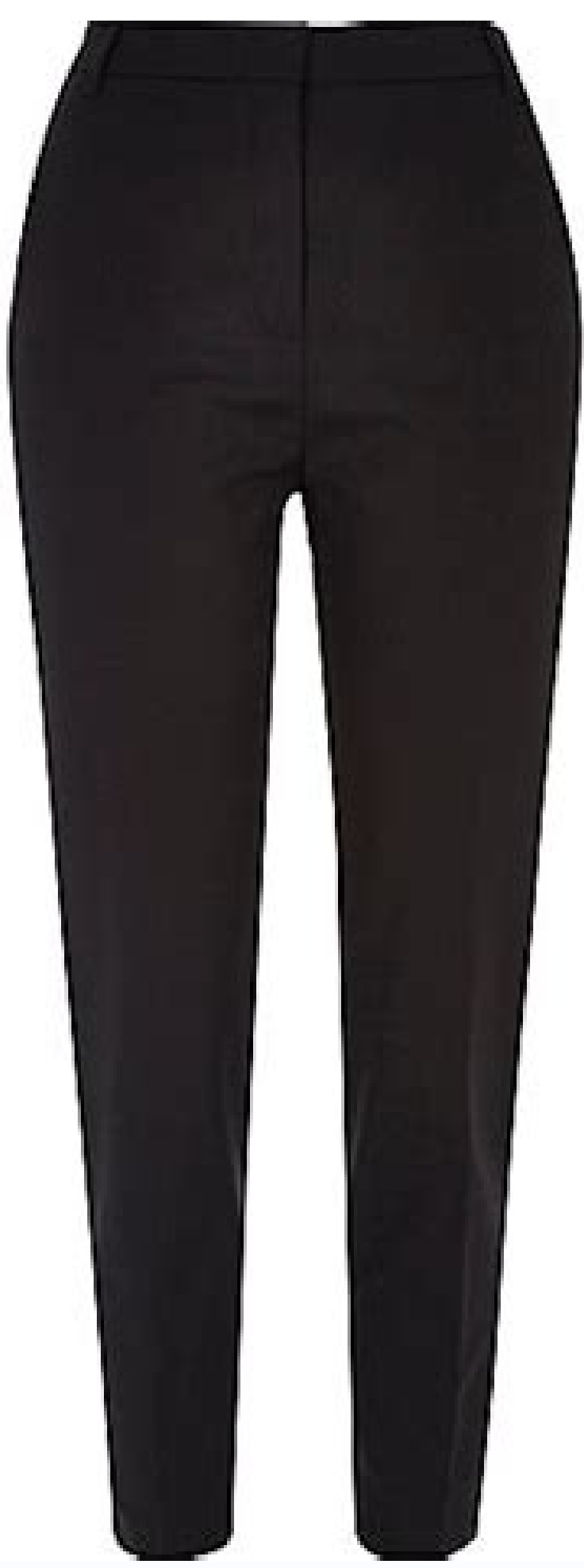
River island mens trousers size guide.